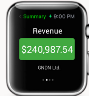
Apple Watch app